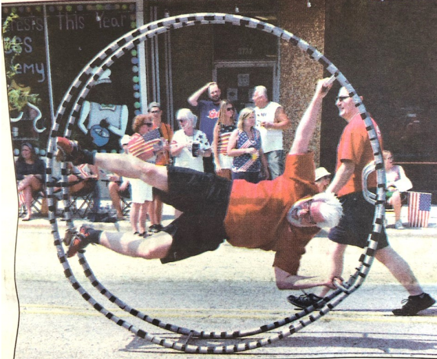
This guy was head over heels during the Brookfield parade.

We had a nice group that marched in the parade for Sokol Spirit. The wheel was a huge hit! We distributed flyers while we marched in the parade. It was a great day for a parade. A fun time was had by all of those who participated!