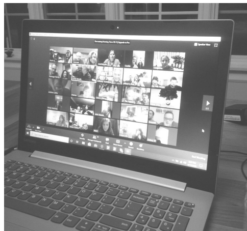
Photo at right: This is the screen of my laptop during the April Virtual World Beer Club on April 17 which was held via Zoom. 32 families joined the event; the screen couldn't even fit everyone at the same time! People from four states participated—some people we haven't seen for a while, and of course some of our 'regulars'. Virtual World Beer Clubs were held in April, May and June. It was great to see everyone and enjoy some Sokol camaraderie in a socially-distant way. Cheers!

Also, Czech language course information will be listed in the August Spirit-News as well.