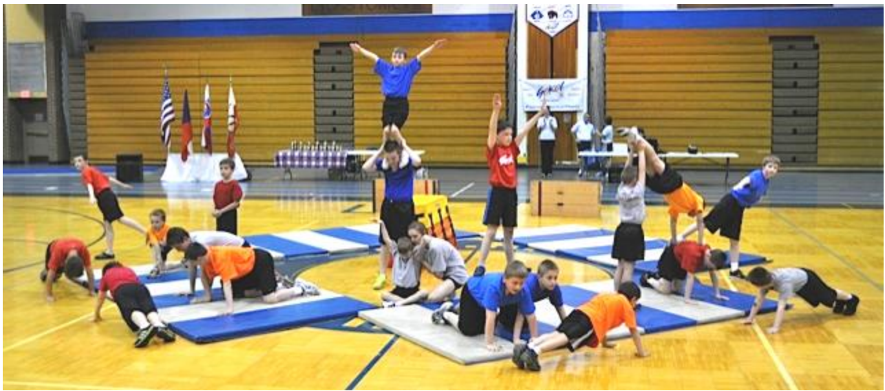
The senior mixed number was chosen to perform at the Opening Ceremonies at the Sports Festival in Milwaukee! Cheers to this hard-working group! You will represent Sokol Spirit well at the national Slet.